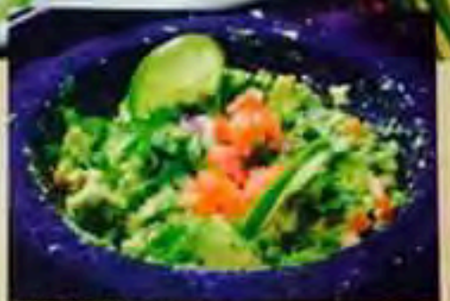
Fresh Table Side Guacamole