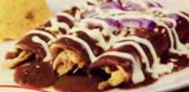
Enchiladas Mole Poblano