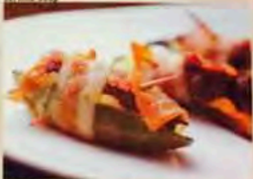
Jalapeños con Queso

*NOTE: COOKED TO ORDER CONTAINING RAW OR UNDERCOOKED MEATS, POULTRY, SEAFOOD, SHELLFISH OR EGGS MAY INCREASE YOUR RISK OF FOOD BORNE ILLNESS, ESPECIALLY IF YOU HAVE CERTAIN MEDICAL CONDITIONS