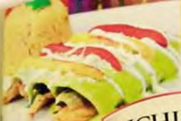
Spinach and Chicken Enchiladas