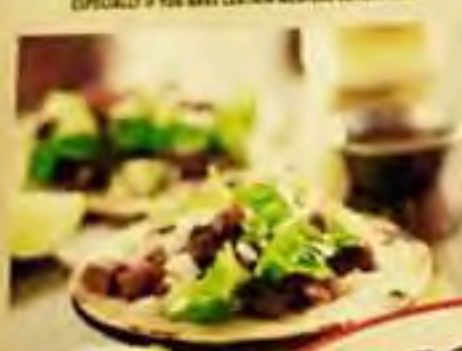
Tacos Carne Asada

*NOTICE: GRILLED TO ORDER CONSUMING RAW OR UNDERCOOKED MEATS, POULTRY, SEAFOOD, SHELLFISH OR EGGS MAY INCREASE YOUR RISK OF FOOD BORNE ILLNESS, ESPECIALLY IF YOU HAVE CERTAIN MEDICAL CONDITIONS