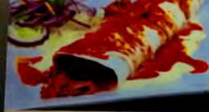
Burrito Cochinita Pibil