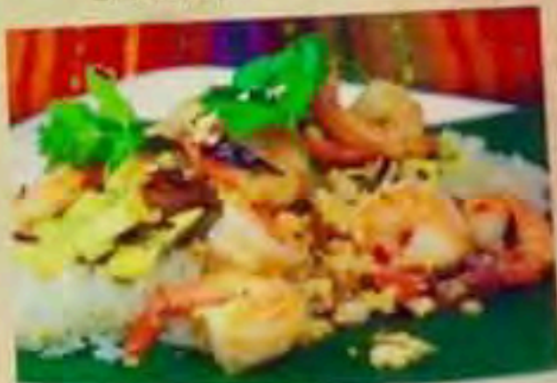
Camarones al Mojo de Ajo

Your choice of Grilled chicken or Shrimp, three kinds of bell peppers and pasta, topped with special Alfredo sauce and fresh tomatoes with parmesan cheese 13.75